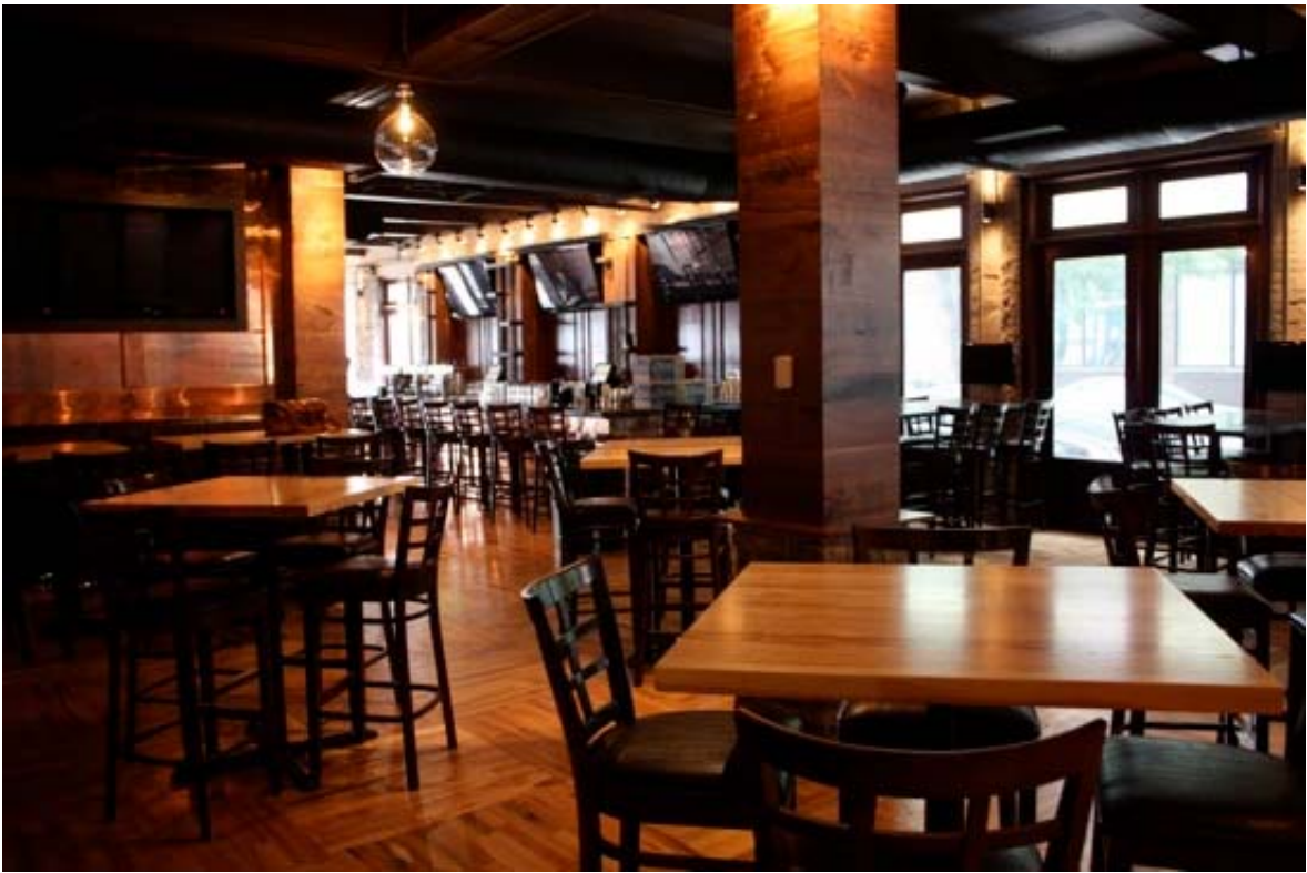
The interior of the Scout, from the back.