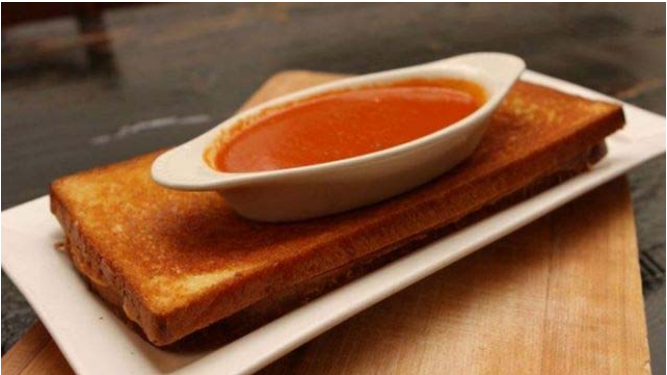
The Scout's footlong grilled cheese sandwich.